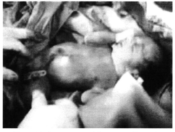
Normal baby separated from acardiac twin