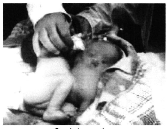
Conjoint twins Showing omphalophagus acardiac second twin

Monozygotic conjoint twins or Siamese twins are due to late separation of the embryos, developed from a single fertilized ovum. If the site of union is abdominal wall, it is called Omphalopagus .<sup>5</sup> Usually the twins are females as in our case.